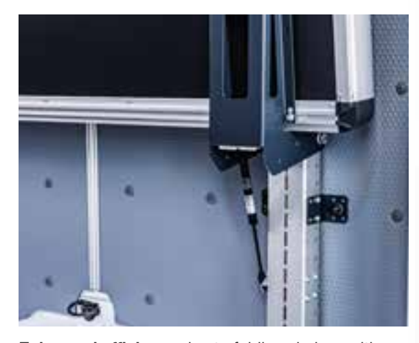
Enhanced efficiency due to folding shelves with gas struts for one-handed operation