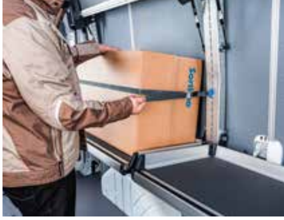
Time savings due to integrated load securing with ProSafe