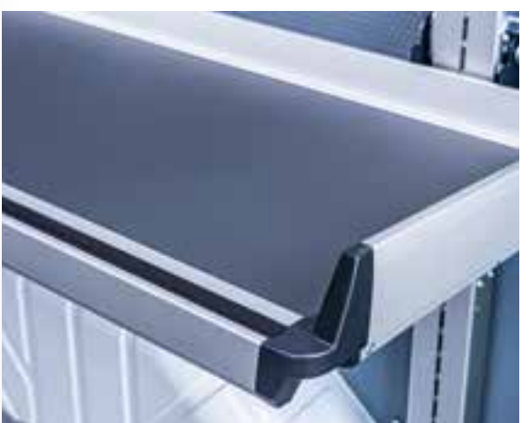
Reduction of the carbon footprint due to CO<sub>2</sub>-neutral production using recycled material