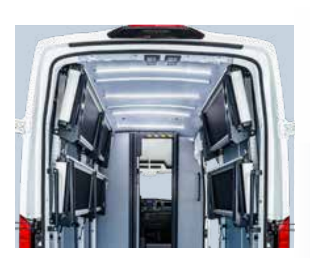
Optimum use of the loading space, as the system can be adapted to the shape of the vehicle